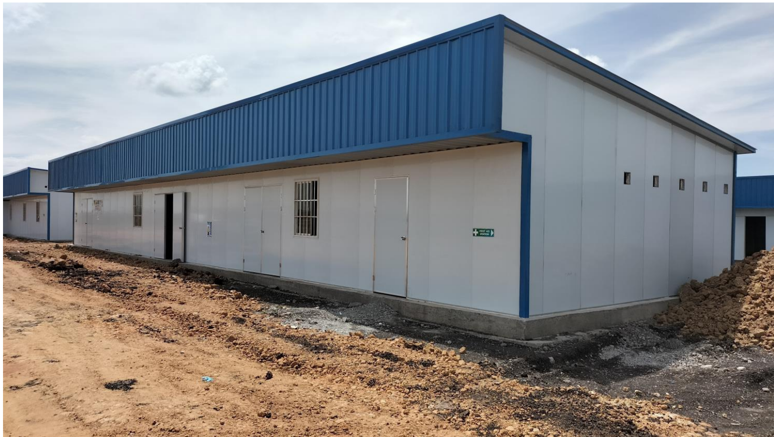
Korea Bomi Offices Machakos Konza City www.bomienc.com