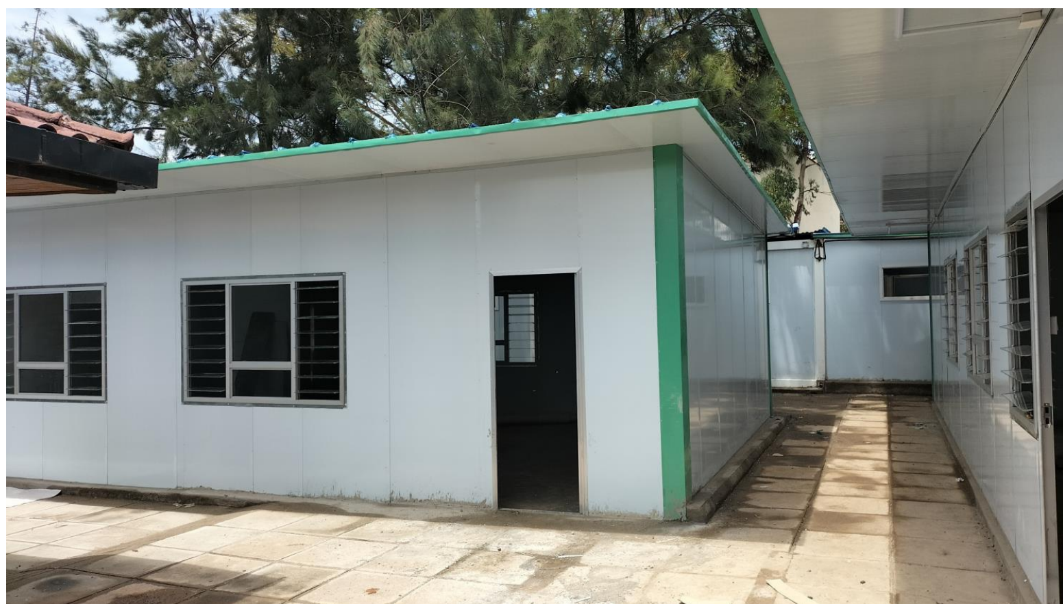
Kiota School Kilimani Kasuku Road www.kiotaschool.com