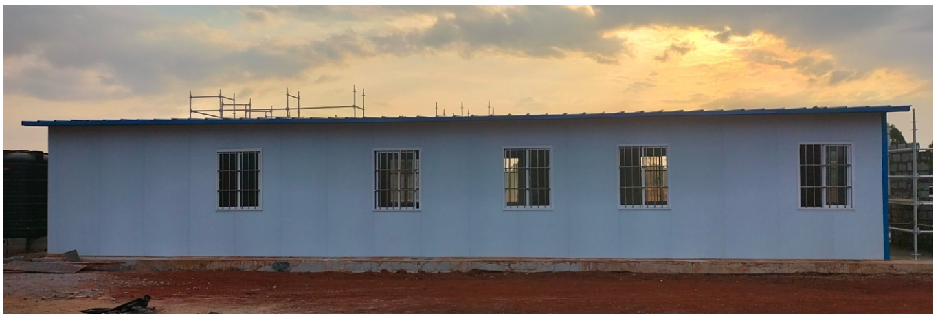
Unity Homes Tatu City Operations & Sales Offices www.unityhomes.co.ke