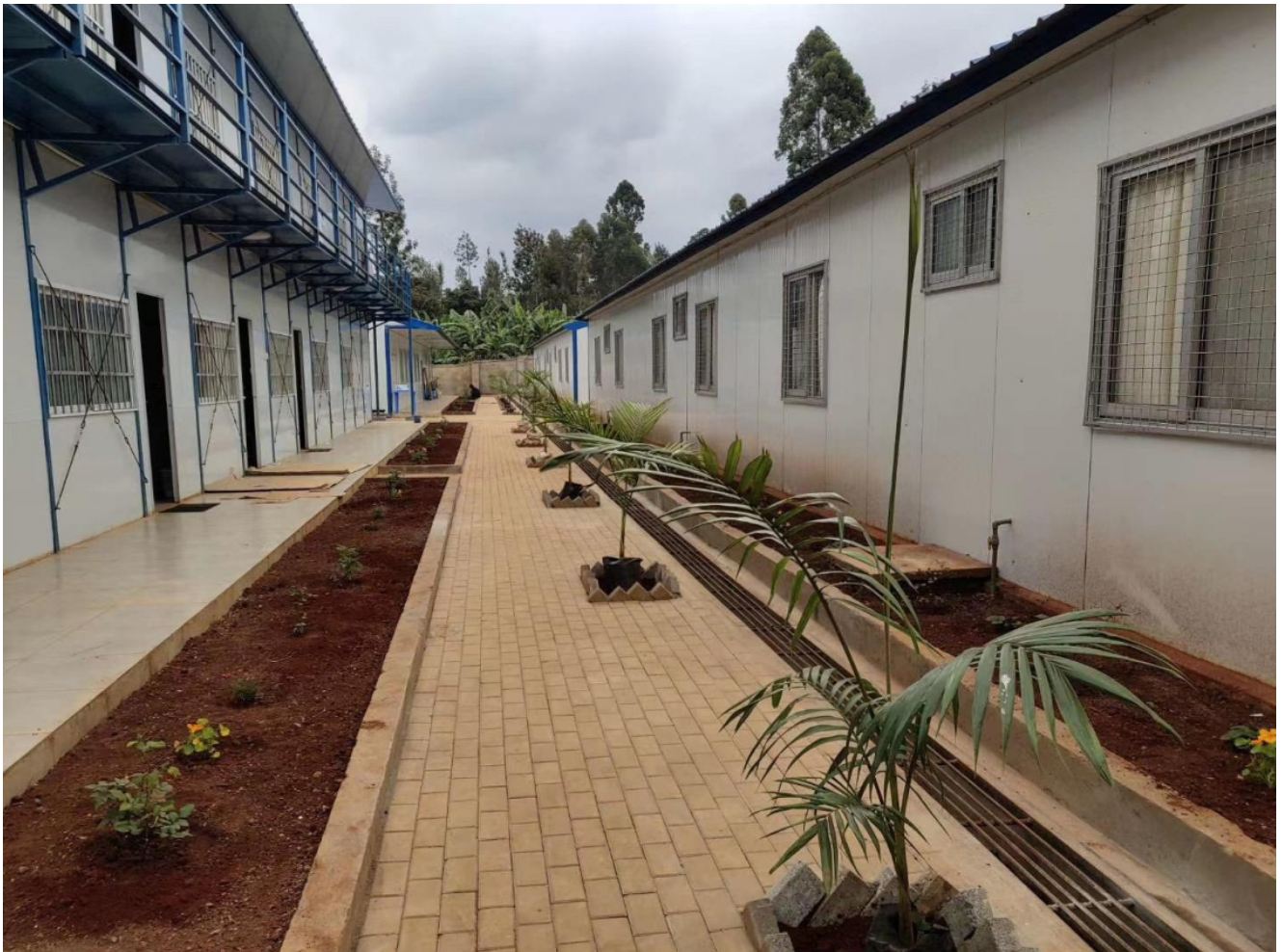
China State Construction Engineering Site Ruiru Offices www.english.cscec.com