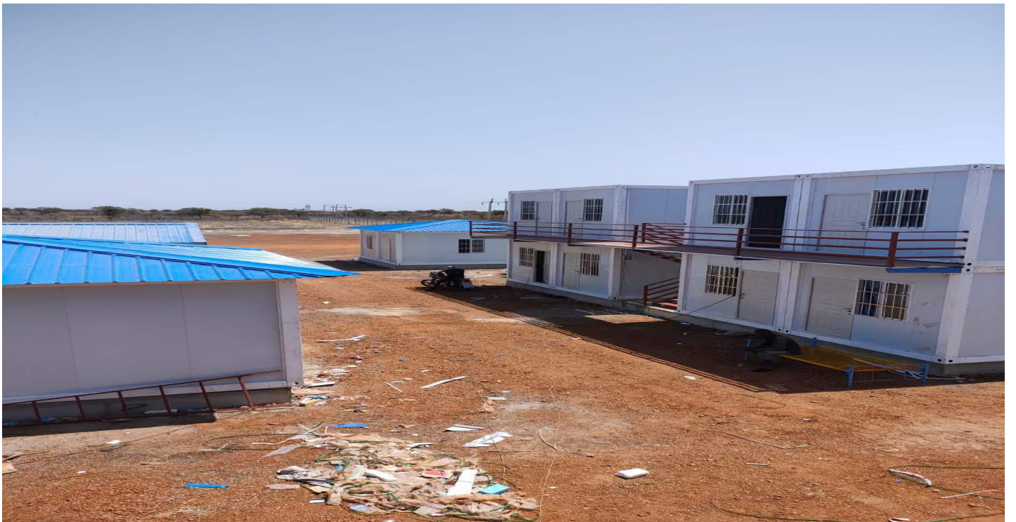
China State Construction Engineering Site Kwale Residential & Offices www.english.cscec.com