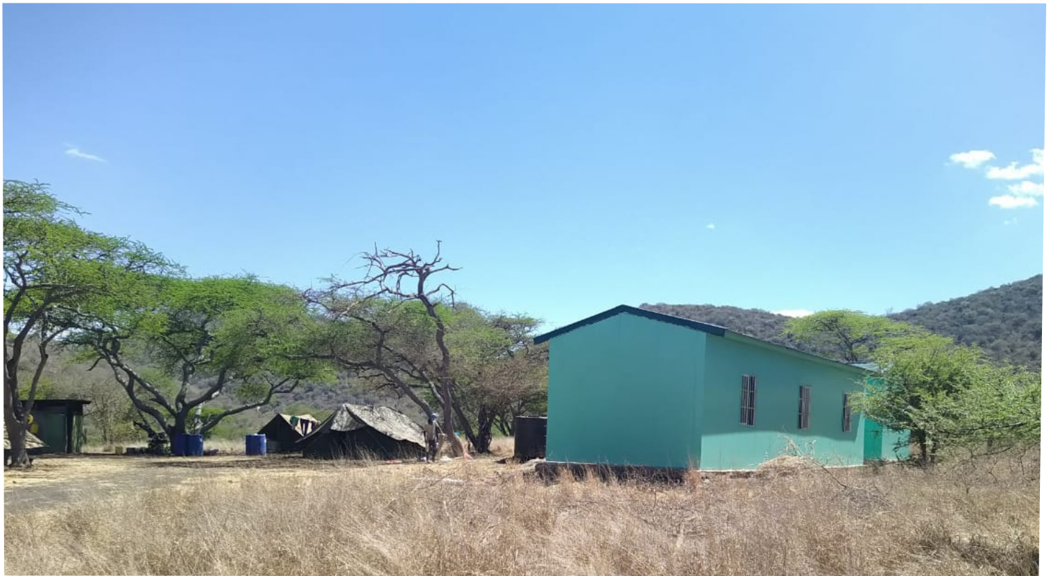
TSAVO WEST GAME RANGERS HOSTELS